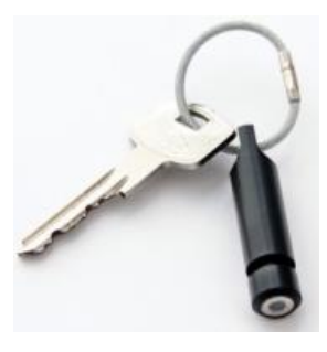
1 – RFID key holder plug and vandal-proof keyring

• Safety key cabinets – for keeping keys safe and manage them in a supervised, authorized way – ProxerSafe Smart and KeySafe Lock cabinets