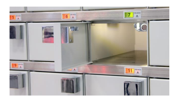
3 – Value storage boxes

• Value storage cabinets – to keep tools, documents, mobile devices safe and manage them in a logged, traceable and authorized way – ProxerSafe Box (Rack) cabinets