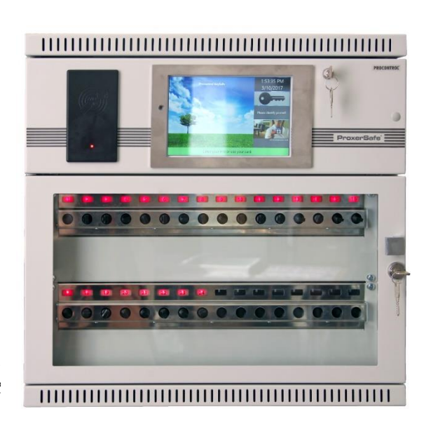
2 – KeySafe Lock 24/32 key cabinet

• Value storage cabinets – to keep tools, documents, mobile devices safe and manage them in a logged, traceable and authorized way – ProxerSafe Box (Rack) cabinets