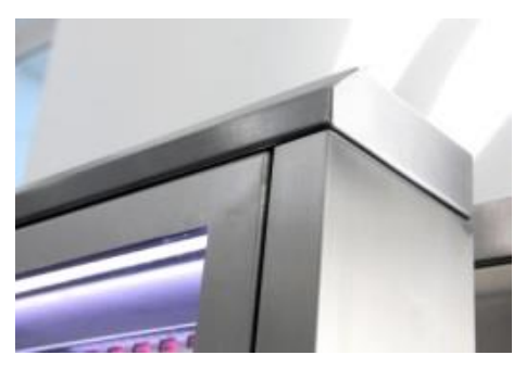
5 - KSLO outdoor brushed steel cabinet

• Industry cabinets – massive steel housing in external or internal design mainly for industrial or heavy usage – see KeySafe products